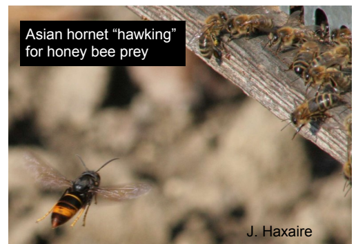
Asian hornet "hawking" for honey bee prey

Asian Hornet abdomen is almost entirely dark except for 4th abdominal segment.